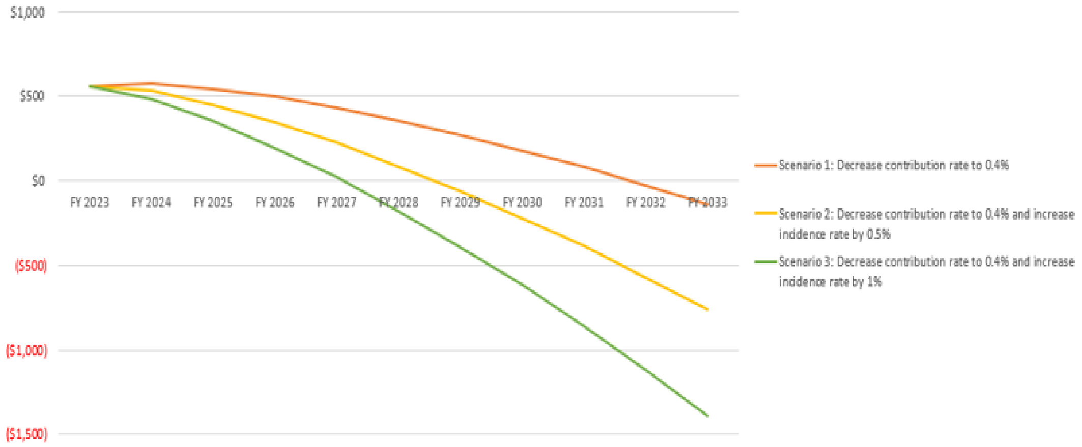
Impact of changing max contribution rate to .4%