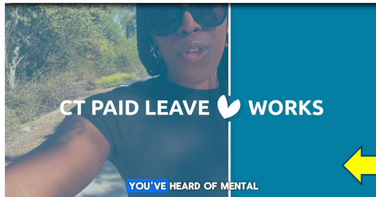
Mental Health (English)