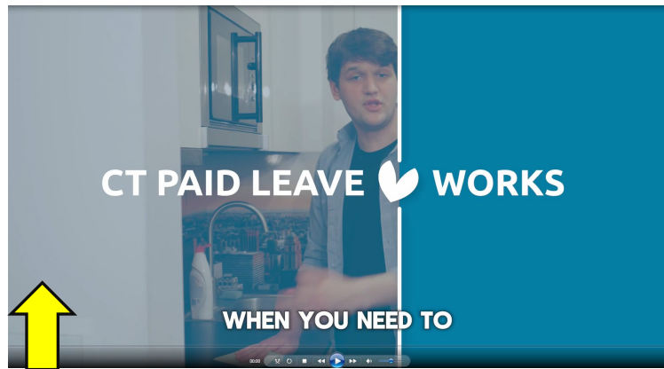
Caregiver Leave (English and Polish)