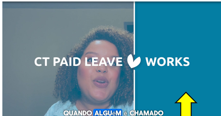
Military Family Leave (Portuguese)